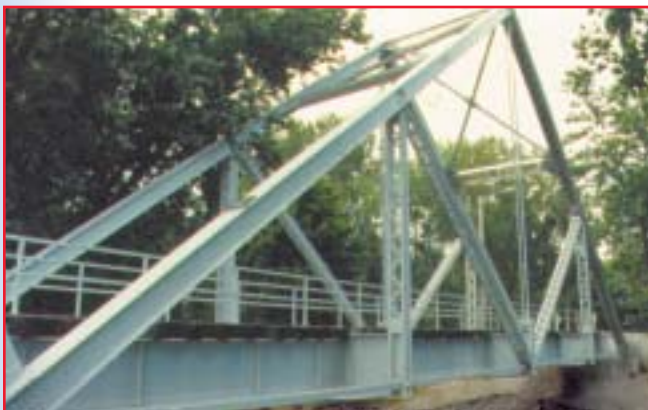
Under a Section 106 agreement, the U.S. Army Corps of Engineers dismantled and stored one of the Nation's last historic Waddell A-Truss bridges to save it from flood damage during construction of Smithville Lake in Missouri. Collaborative efforts led to its reconstruction in a local riverside park.

Sometimes Federal involvement is obvious. More often, the answer is not immediately apparent. If you have a question, contact the project sponsor to obtain additional information and to inquire about Federal involvement. All Federal agencies have Web sites, many listing regional or local contacts and information on major projects. The SHPO/tribe, State or local planning commissions, or statewide historic preservation organizations may also have project information.