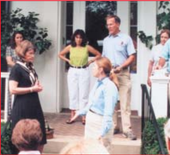
Local groups met with State agencies and city officials to discuss highway improvement plans to ease traffic congestion between Kentucky and Indiana. They expressed concern about the potential effect on sites such as the historic Swartz Farm.

When requesting consulting party status, explain why you believe your participation would be valuable to successful resolution. Since the SHPO/tribe will assist the Federal agency in deciding who will participate in the consultation, be sure to provide the SHPO/tribe with a copy of your letter to the agency.