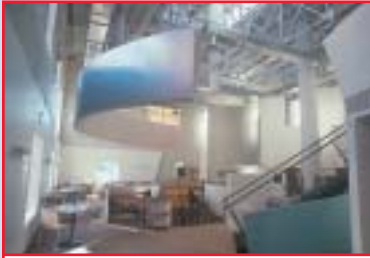
The American Can Company industrial complex in Baltimore was slated for demolition using Department of Housing and Urban Development funds. Citizen groups opposed the project, the ACHP held public meetings, and the buildings were ultimately rehabilitated for commercial use.

In the National Historic Preservation Act (NHPA), Congress established a comprehensive program to preserve the historical and cultural foundations of the Nation as a living part of community life. Section 106 of NHPA is crucial to that program, because it requires