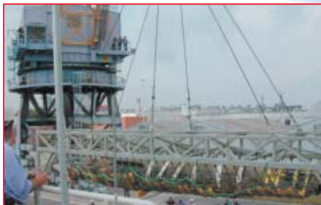
The Confederate submarine H.L. Hunley, which successfully completed the world's first submarine attack on a surface ship, was raised from the ocean floor through funding by an unprecedented collaboration among Federal and State agencies, private-sector organizations, corporations, and individuals.

Section 106 review gives you a chance to weigh in when Federal actions will affect historic properties you care about. Seize that chance and make a difference!