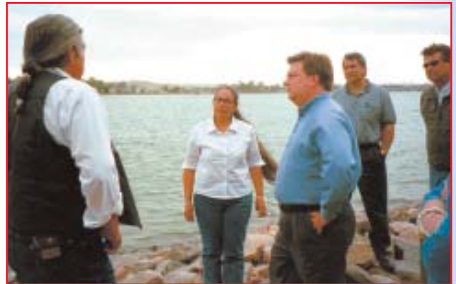
To better provide the Army Corps of Engineers input regarding their management of the Missouri River Mainstem and its impacts on archeological and other historic properties, Indian Tribes and the public toured sites along the river after a public meeting convened by the ACHP.

These and many other Federal actions can harm historic properties. Section 106 review is your opportunity to alert the Federal Government to the historic properties you value and to influence decisions about the Federal projects that affect them.