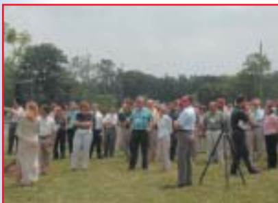
Preservation advocates' involvement with plans to widen Paris Pike, a historic road in the heart of Kentucky's bluegrass region, encouraged highway officials to add landscape architects and preservationists to the design team. The result is a road that's both efficient and in context with its setting.

A vigilant public helps ensure that Federal agencies comply fully with Section 106. In response to requests, the ACHP can investigate questionable actions and advise agencies to do what is required. As a last resort, preservation groups or individuals can litigate in order to enforce Section 106.