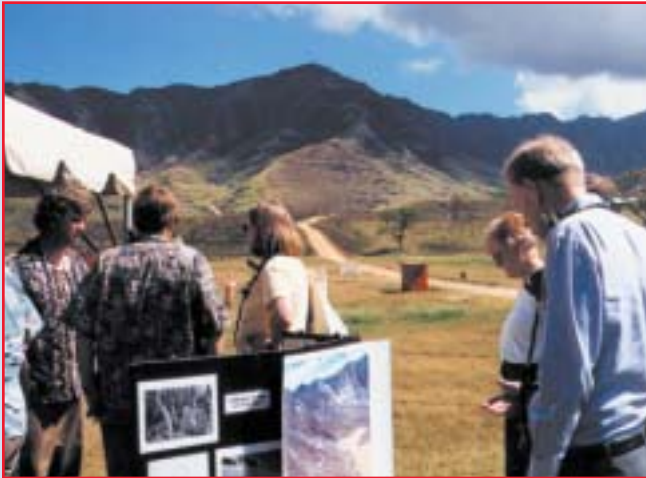
Citizen participation in the Section 106 process balances preservation with ongoing uses of historic properties, as demonstrated at the Makua Military Reservation in Hawaii. Rich in archeological resources, the site is used by the U.S. Army for live ammunition fire training.

If you are concerned about a proposed project and wondering whether Section 106 applies, you must first determine whether the Federal Government is involved. Will a Federal agency fund or carry out the project? Is a Federal permit, license, or approval needed? Section 106 applies only if a Federal agency is taking an action, so confirming Federal involvement is key.