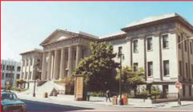
The closure of the old U.S. Mint in San Francisco, a National Historic Landmark that once housed one-third of the Nation's gold reserve, sparked significant public interest that resulted in several meetings where citizens voiced their opinions on the building's preservation and potential reuse.

Under Section 106 review, most harmful effects are addressed successfully by the Federal agency, the SHPO/tribe, and any other consulting parties. So, your first points of contact should always be the Federal agency and the SHPO/tribe. However, the ACHP can also assist with your questions and concerns.