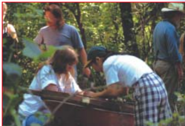
U.S. Fish and Wildlife Service collaborated with the Chinook Tribe and Portland State University to interpret the Cathlapotle archeological site in Washington State. To foster better understanding of the site, the partners developed tours, an archeology festival, and educational programs.

When the Federal agency releases information about project alternatives under consideration, make it aware of the options you believe would be most beneficial. To support alternatives that would preserve historic properties, be prepared to discuss costs and how well your preferred alternatives would meet project needs. Sharing success stories about the treatment or reuse of similar resources can be helpful.